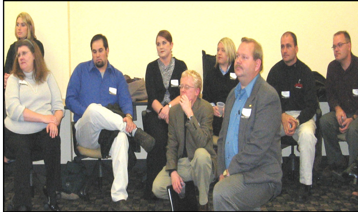
Students, faculty, and alumni gather for the Fall Reception in October to hear the state of the program and to mingle

We now have a MPA External Advisory Board consisting of well-known area practitioners from the public and non-profit sector. This is a very involved and motivated group. The board's mission is to assist in our goal to become a premier program in this region. Another important initiative that we undertook this year was to get students' feedback on different aspects of the MPA program. We are currently processing the